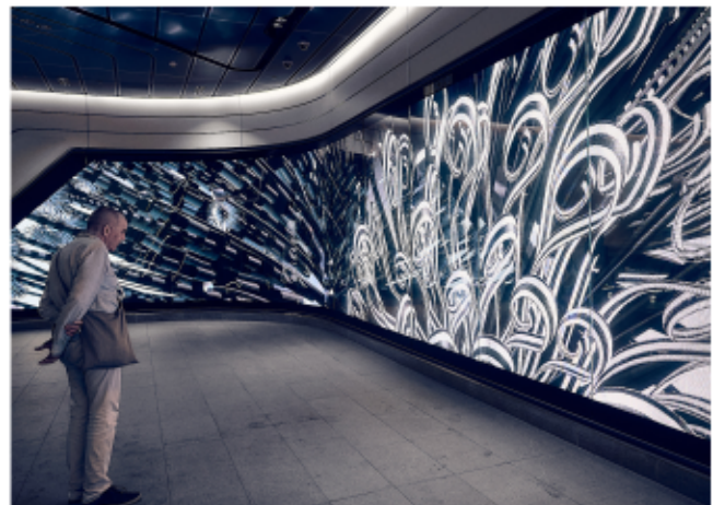
Figure 4: A public installation based on the 50 Sister’s series, generated by McCormack ML algorithm from the components of oil company logos.

Wolfe’s work is constantly calling our attention to our existence as part of nature not apart from nature, through work that is ripe with metaphor, symbols and references. Green to Red is built from a musical composition and supported by large outdoor presentations and interactive displays of unraveling yarn that present climate-related environmental data [23]. Wolfe’s exhibits draw large audiences though her use of music, imagery, tactile interfaces, participatory affordances, and targeted immersion. Digital versions of her work provide touch screen interactivity when interaction is highlighted. Her longer timelines are not real-time but immerse her audience in a visceral sense of the present moment, accompanied by poetic