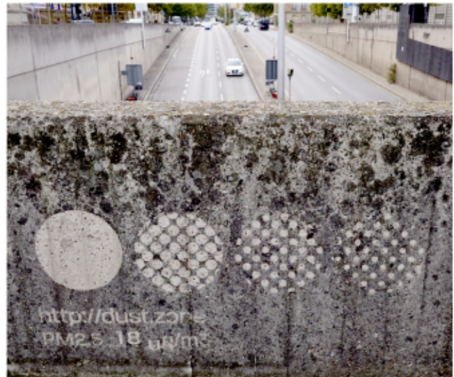
Figure 5: Offenhuber’s Dust Zone physicalizes the otherwise unseen.

lyrics and well-crafted tune. Shorter time-line installations support real-time presence through use of multiple sensory layers.