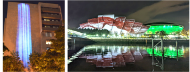
Figure 3: Andrea Polli's Particle Falls , left, and Beatie Wolfe's Green to Red , right, are both large outdoor installations drawing the attention of a large audiences.

Particle Falls , shown in Figure 3 illuminates, literally, the particulate matter in the air which we cannot see [17]. Air pollution sensors show us the conditions of the air we are breathing in real-time. As a plane flies overhead we watch the "Falls" change in volume and composition, showing us the direct impacts of our transportation choices, in a mesmerising, curious community-engaging presentation. The focus on air quality provides a visceral connection to our lungs. Her visual connection to urban sources of air particulates expands effectively to discussion of global air quality, while using a waterfall projection to reinforce the connection of human dependencies. The larger scale and real-time animation of Andrea's work contrast well with Meilbach's work to support lively discussion.