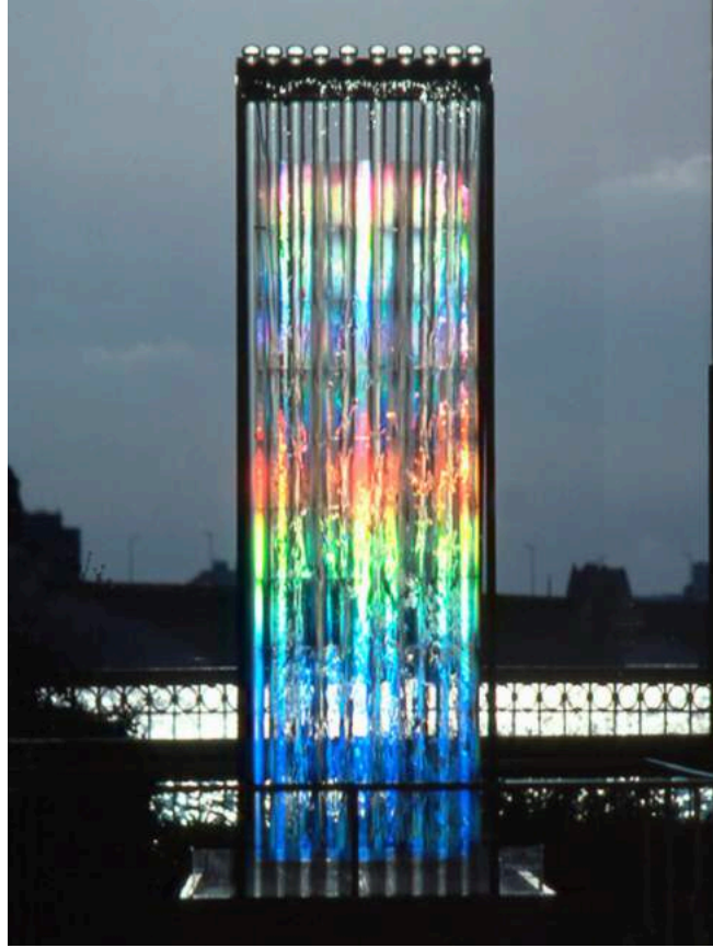
Figure 2. FocalPoint is a solar water fountain, 12'x 4'x 8', with holographic optical elements, glass pipes, steel, and a water system. Designed to focus sunlight into 3 lines of light that scan across the floor and walls in response to the sun's motion. Installed here at the Boston Museum of Science overlooking the Charles River, Boston, Massachusetts.

“I knew I wanted the light to be the functional aspect of inFLUX , the active ingredient doing the drawing and leaving a trace of its path, so that people could find a place where they were just caught – and in art when you get caught there can be a moment of silence. You are caught where you aren't thinking and you aren't just emoting, but are transfixed as if through to the solar plexus. As an artist, occasionally, I hope to catch someone before words. In that place there is experience. I aim for that ongoing sense of wonder when one has to stop long enough to see and feel. Otherwise it goes right past you or you go right past it.”