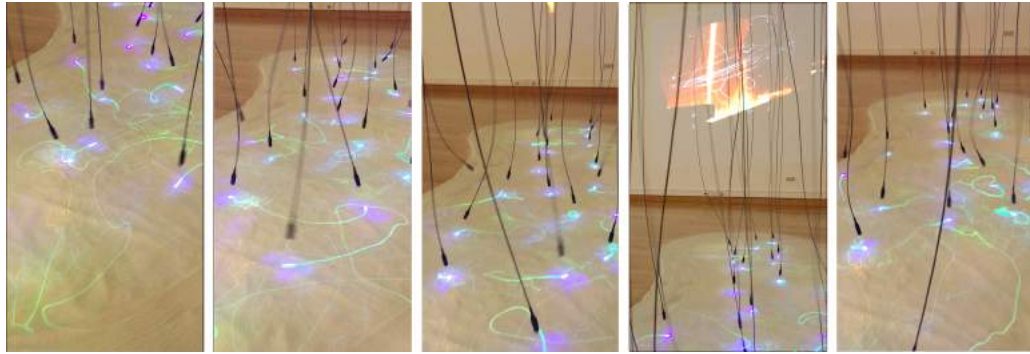
Figure 4. A series of stills from inFLUX at the Butler Institute of American Art. Each laser draws in the sand by illuminating pigments, which glow in response to the light. Over time, patterns emerge and fade to be redrawn as the pendulums interact, collide, twist and pass by each other. Photo credit: Sally Weber. (Used with permission.)

ously on top here but there is this complexity underneath. That complexity is all that the light drew over time. It is gradually fading or being reinforced continually.”