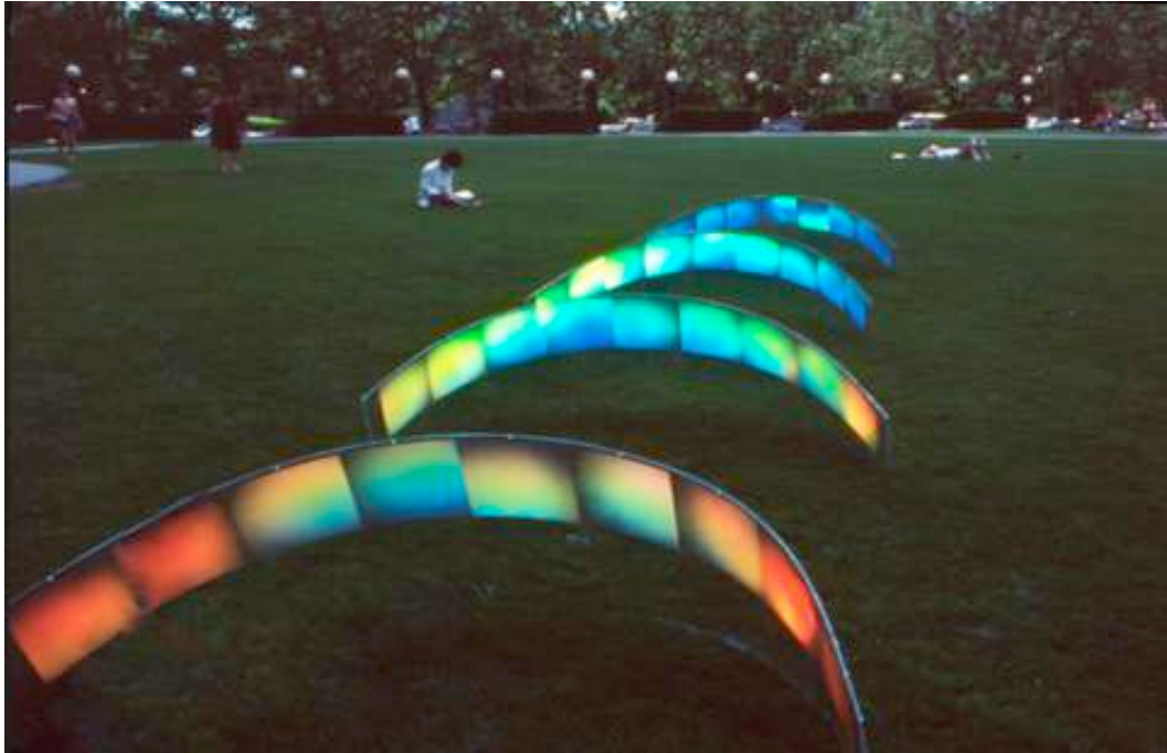
Figure 1. LightScape , is a solar installation using holographic optical elements and acrylic. Sited on Kresge Lawn, Massachusetts Institute of Technology, Cambridge, Massachusetts. Designed to reflect the sun's arc across the site and Kresge Auditorium's curved roof. The holographic elements float above the ground and alter in color with the sun's angle and the viewer's distance from the installation.

Ms. Weber's work is complex and wide ranging in media and content. Focusing on her current exhibition inFLUX below, Weber speaks of the work, the process and underlying principles in her own words: