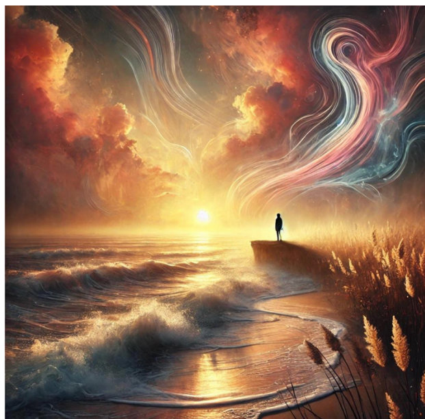
Figure 8 – AI-generated image from the lyrics for August by artist Flipturn. Student Avery Siefried characterized the song as a surf-indie-rock style (images used with permission).

The student set her intent for the final project with these words: