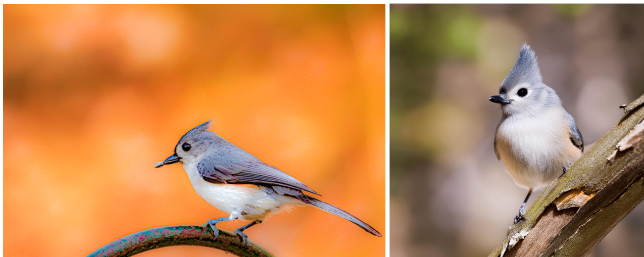
Figure 7 –Tufted Titmouse photograph taken by a student (left) and AI generated image produced by Adobe Firefly (right).

The student then submitted various images that had been AI-generated, in a format seen in Figure 8. She opined on the results with each of the images containing some flaws in lyrical interpretation or mood conveyance. The positives she mentioned balanced the flaws to provide an overall neutral reaction to what genAI did in the experiment.