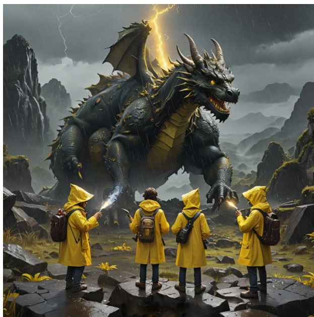
Figure 2 – Example week 1 group exercise result with prompt: Dragon talks to the Beatles smoking pipes, in the rain, wearing yellow rain jackets, atop Machu Picchu with glowing elements in the ground, hyperrealistic, hd image-1

The first exercise of the UEAI course invites students to participate in an AI-facilitated image generation exercise. Students take turns adding a word or phrase to a growing text prompt they submit in an AI image generator (an online genAI tool) and use the previously generated image as an image prompt component in conjunction with the text prompt. The exercise is intended as an ice-breaker whereby some norms of vocabulary and interactive discussion can be formed to pursue consensus among students.