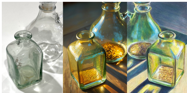
Figure 3 – The steps in the example used for teaching colored pencil sketching. A reference photograph (left). A genAI tool output result (middle). A photograph of the final hand-drawn sketch (right).

The student had spent weeks two through five investigating the potential of AI in assisting his personal artistic practice which produces output in painting media. He felt confident that AI might be useful in demonstrating a colored pencil sketching artistic process through producing pencil sketches based on reference images of painted artwork. He then tested that confidence to see if it was warranted or not.