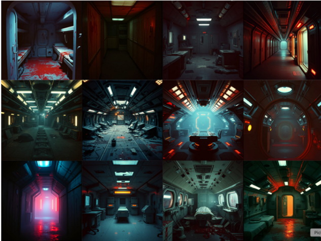
Figure 9 – Examples of AI-generated play locations for a sci-fi/horror video game, as prompted by student Emma Hitchcock.

The student produced results supporting character and enemy design through additional work, with the enemy results appearing more exotic yet similarly useful for engaging the artist's vision for the game (see Figure 10).