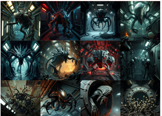
Figure 10 – Examples of AI-generated enemies for a sci-fi/horror video game, as prompted by student Emma Hitchcock.

The student produced results supporting character and enemy design through additional work, with the enemy results appearing more exotic yet similarly useful for engaging the artist's vision for the game (see Figure 10).